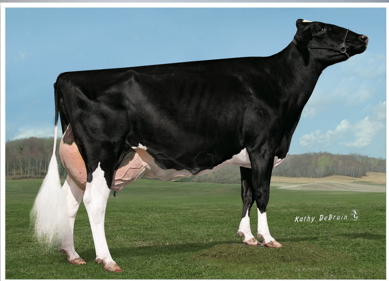
3RD DAM – GLORYLAND-I GOLDWYN LOCKET-ET EX-94